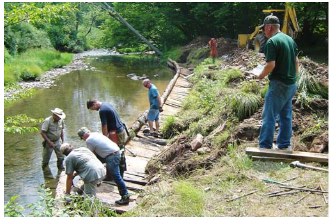
Hard at work on a mud sill structure at the site behind Kiski Camp on Cross Fork Creek project.

-submitted by Amy Wolfe, Trout Unlimited