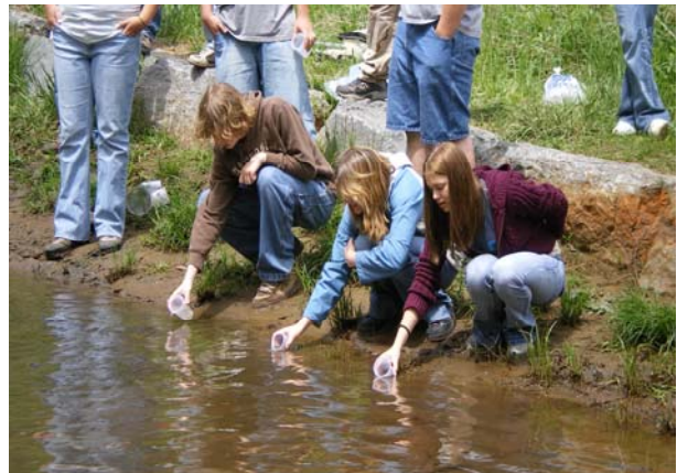
Students on a May day releasing the fry into Kettle Creek at the Headgate area.