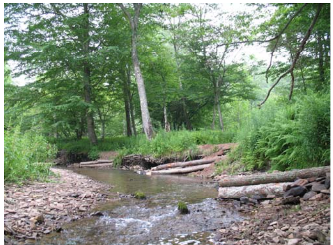
Completed log vanes at Site 3, above Bear Trap Lodge on Cross Fork Creek.