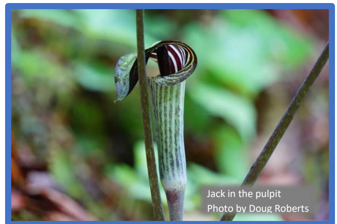
Jack in the pulpit

lifeblood of this organization. Without our members, the KCWA's mission to Enhance, Preserve, Monitor, and Protect would not be possible. After reading this article I would like to ask you, the reader, to please forward this newsletter via email or send via Facebook to someone who may be interested. Thank you for helping our organization to grow and thank you for reading.