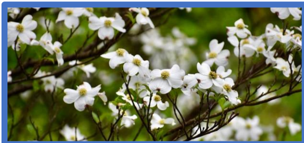
Dogwood flower

The terrible weather forecast didn't disappoint. It rained on the 18th, and most of the morning on the 19th. Despite promising to sit and relax all weekend, we got stir crazy and decided to go for a ride and perform a stream survey. Now, I figured the best I would do was find out how many Dogwoods were blooming between Camp and the Fly Project. I think all of them were in full bloom that weekend and the contrast between the fresh yellow green, and wisps of mist from all the rain made the white blooms with their rose tips pop out. The other noticeable item we discussed while driving up the Valley was that we should have an amazing acorn year. The little tassels that hang from an oak tree this time of year are catkins. Oaks self-pollinate and these are the blooms that release pollen. The female side, which produces that acorn, is smaller, less conspicuous and reddish. The number of catkins makes me imagine that this year will be a bumper crop.