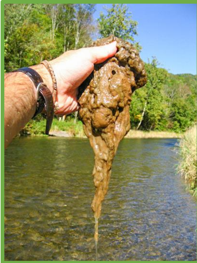
Didymo aka Rock Snot, photo by Tim Daley, PA DEP

along a stream you may not have access to hot water or a deep freeze. What's a conscientious angler to do? If you are going to be fishing in various watersheds at a minimum take along a bucket, a soft brush and some Dawn dish detergent. Thoroughly scrub your waders and boots. Pay careful attention to the soles. That small little pebble that is as long as two tippet rings laid side by side may be a mudsnail. You may not even see didymo.