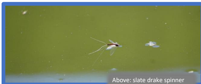
Above: slate drake spinner Below: native brookie

Just two weekends ago, as my Dad and I were fly fishing we witnessed a large black-phase timber rattlesnake swim across the entire width of the creek and sun itself on the near bank. The fishing was fantastic that morning but I can safely assume that even if it hadn't been all that good, that this sighting would have made our morning! If you are out in the woods this summer and happen to come across a timber rattlesnake, be cautious, keep a responsible distance, and please enjoy these fascinating reptiles from a safe distance.