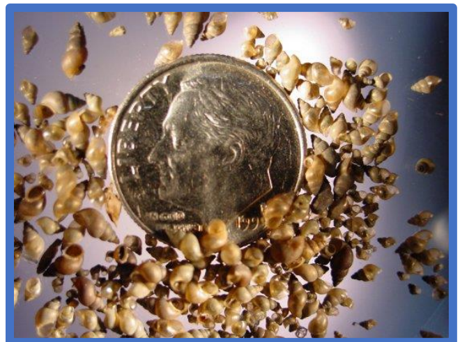
New Zealand Mud Snail

The KCWA is now on Facebook! In order to maintain a closer relationship with members and keep all of those that support us up to date with the latest information, we have decided to create a Facebook Page. This page will have regular posts regarding upcoming projects and improvement activities as well as updates on recreational activities in the valley (i.e. hiking, fishing, snowmobiling, etc).