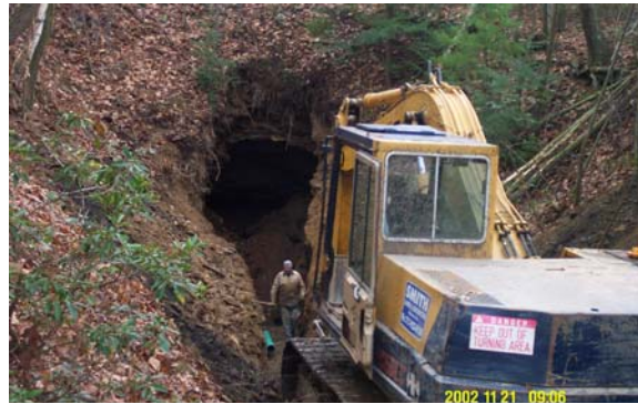
Several deep mine openings such as this one were uncovered during the construction. Pipes were installed at these openings to collect polluted drainage from the abandoned mines.

The installation of a collection system for Huling Branch AMD discharges was completed in mid-December. Monthly monitoring of flow and water chemistry will help us to determine what type of treatment alternatives may be considered to remediate Huling Branch and alleviate Twomile Run of its worst contributor of AMD. Hedin Environmental will analyze the data and generate a final report to evaluate treatment alternatives. The report is due to be completed by June 2004.