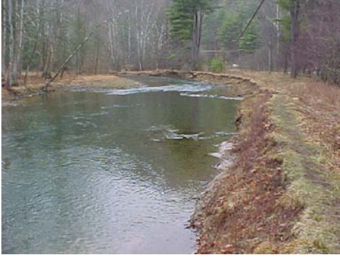
BEFORE: View looking downstream from upper end of project reach.