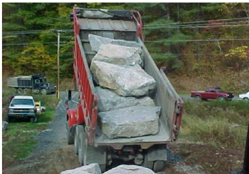
PennDOT contributed 1400 tons of wall rock for construction of cross vanes and J-hooks. This amounts to nearly $30,0000.