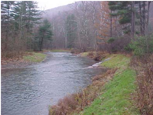
AFTER: View looking downstream from upper end of project reach.