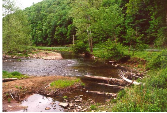
BEFORE: View looking downstream towards SR 144 in middle of project reach.