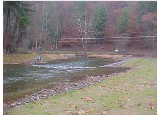
AFTER: Same view after regrading of streambank to a gentler slope, construction of a cross vane, and installation of a mud sill on this section of the project.