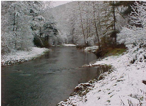
Early snowfall in late October provides a scenic backdrop for the upper end of the Headgate project reach.