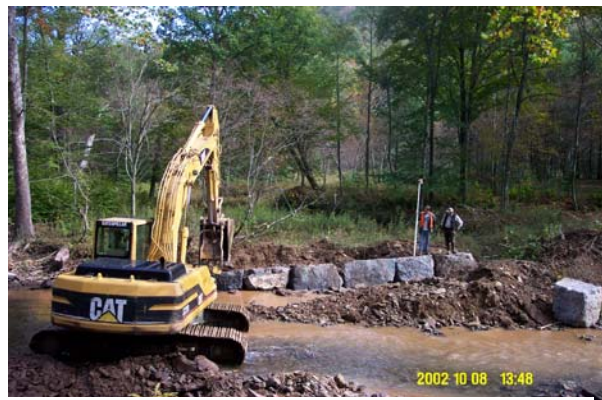
Dave Putnam (Far right, USFWS) watches as Neil Wolfe uses a laser level to ensure the rock vanes are installed at the correct grades.

It is the KCWA's and TU's hope that this project will serve as a model of successful partnerships between various agencies and organizations for efforts where seemingly different objectives are sought (such as road protection and fish habitat improvement as in this case). By working together, even with different end goals in mind, it is amazing what can be accomplished. That said, we also hope this project demonstrates that riprap (which is not known for its fish habitat qualities) is not the only means available for road protection, and by working together as a team, benefits can be realized for everyone (even the fish).